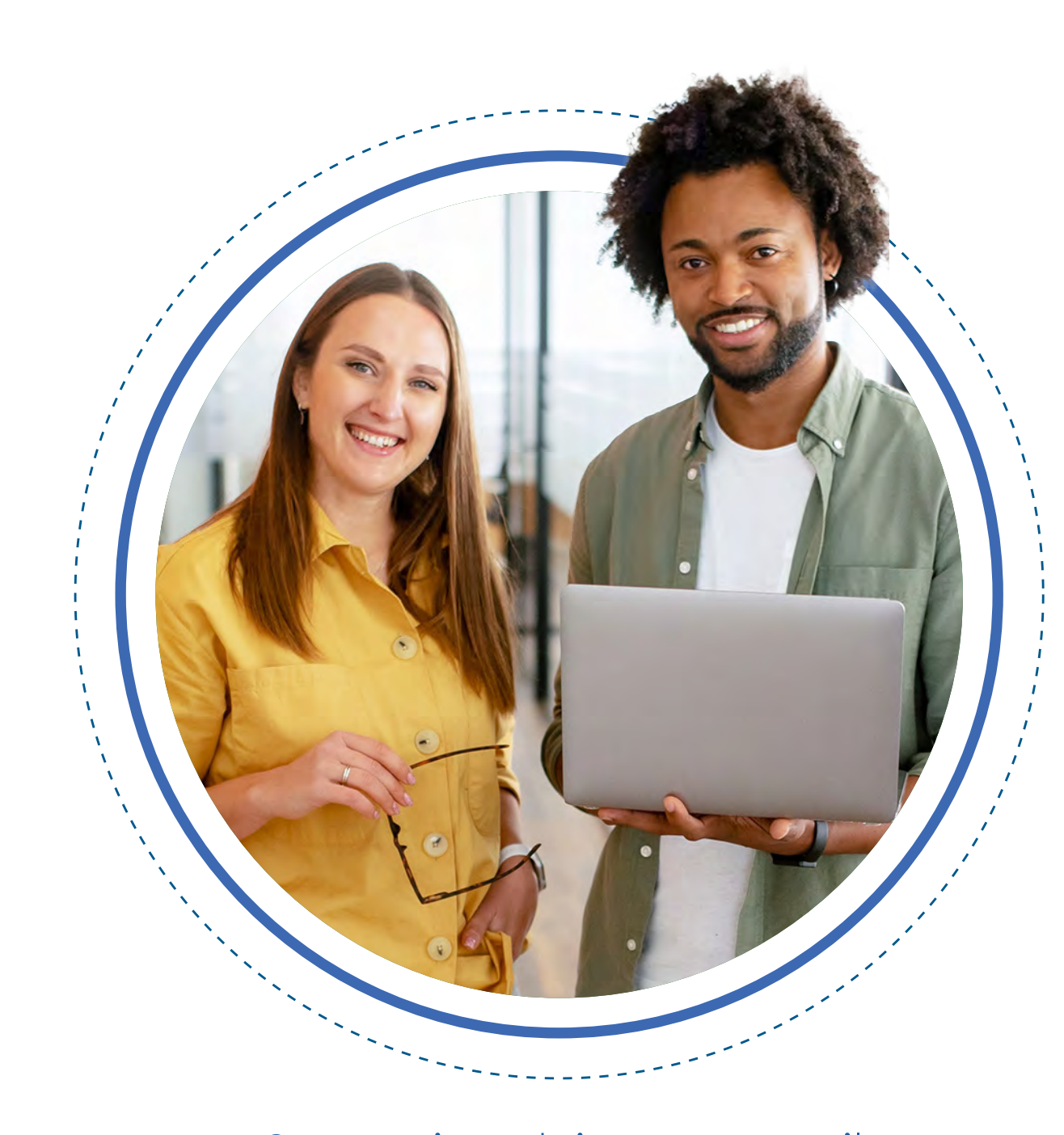
Strategic advisory council